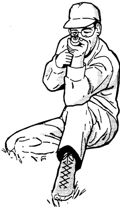
(2) Kneeling Position