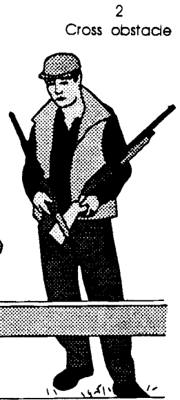
2 Cross obstacle