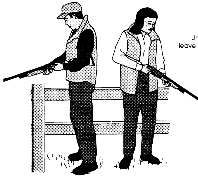
1 Unload and leave actions open